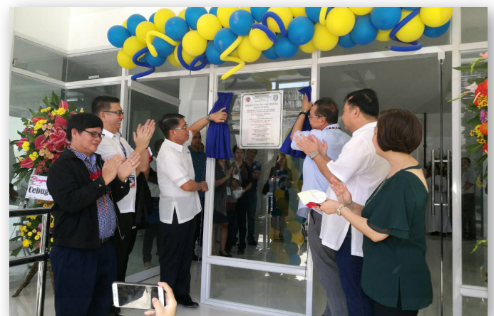
Blessing and Turnover of the MARINA Region 6 building located at De La Rama St., Iloilo City on 27 September 2018

Aside from providing frontline services to maritime stakeholders in Bacolod City and nearby provinces, the new extension office will house the MARINA training and research center for the Agency's technical personnel to capacitate them to effectively perform their duties and responsibilities. Training programs are likewise envisioned to be delivered for industry stakeholders.