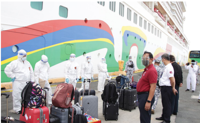
A total of 1,078 repatriated seafarers were previously on board MV "Norwegian Encore"

MANILA - The maritime sector of the Department of Transportation (DOTr), consisting of the Maritime Industry Authority (MARINA), Philippine Ports Authority (PPA), and the Philippine Coast Guard (PCG), together with the members of the One-Stop Shop (OSS) Port of Manila has assisted the disembarkation of the 1,078 repatriated crew members of MV "Norwegian Encore". The MV "Norwegian Encore", which is owned by the Norwegian Cruise Line, arrived in the country on 11 April 2021, and ferried a total of 1,078 repatriated seafarers - composed of 1,058 Filipino and 20 foreign crew members.