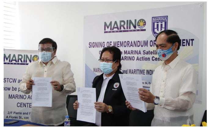
The establishment of the MARINO Action Center (MAC) signifies more accessible services for seafarers.

"We are happy for this opportunity to work with