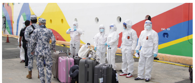
Seafarers in full personal protective equipment (PPE) await their clearance during the disembarkation process.

The Philippines, having positioned itself as a crew change capital in the world through the DOTr and its maritime sector, commits to provide world-class services to international vessels needing fresh crew onboard amid the pandemic. The member agencies of the OSS also collectively assure the public that the government is ensuring that health and safety protocols are strictly observed to help prevent and manage the continued threat of the COVID-19 disease.