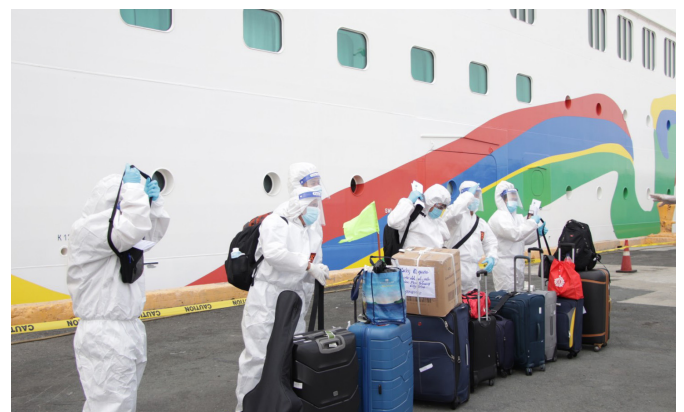
The maritime sector of the DOTr continues to ramp up efforts to facilitate more crew changes to further assist distressed and stranded seafarers amidst the pandemic.

As the Philippines expects more international vessels to conduct crew changes in the country, the DOTr, under the leadership of Secretary Arthur Tugade, assures the public that it will continue to extend its assistance to Filipino and foreign crew members while implementing the necessary measures to contain the spread of the COVID-19 disease.