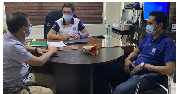
The meeting was an opportunity for the two Regional Directors to discuss relevant matters for the transition of the MARINA to the BARMM.

Furthermore, the MARINA BARMM employees will also be tasked to handle the Modified Basic Safety Training (MBST) for the crew members of the vessels under its area of responsibility (AOR).