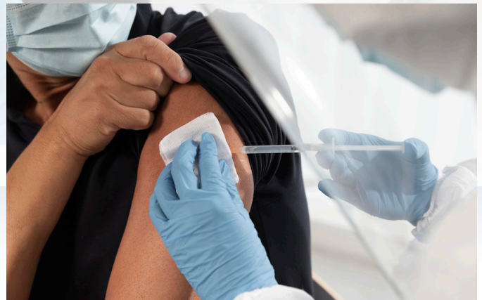
The prioritization of seafarers in the national vaccination program ensures that Filipino seafarers are promised continued employment on international and domestic vessels.

Aside from DOTr, the working group is composed of officials from the Maritime Industry Authority (MARINA),