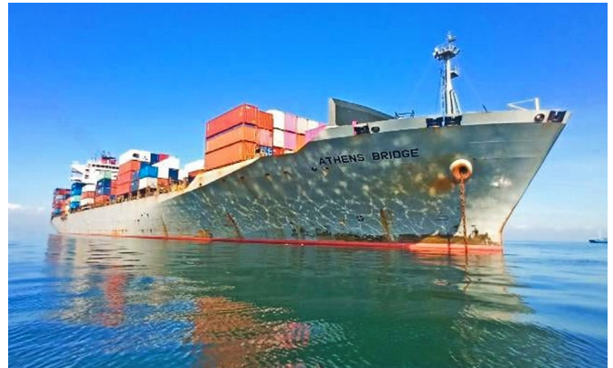
COVID-19 positive vessel MV Athens Bridge, which came from India, carrying Filipino seafarers.

The BOQ reported that the COVID-19 specimen that has been collected from the crew members has already been submitted to the Philippine Genome Center (PGC) to identify the COVID-19 variant that