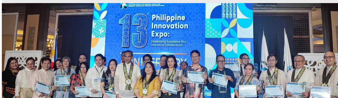
Receivers of Kabalikrat Awards pose for a group photo to commemorate the event.

MARINA's achievement highlights its commitment to innovation, collaboration, and excellence in advancing the maritime industry and ensuring the nation's continued progress in the field.