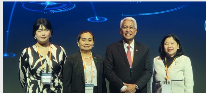
Philippine delegation, led by the Department of Transportation Undersecretary for Maritime Elmer Sarmiento, during the Korea Maritime Week 2023.

The Philippines' active involvement in the Ministerial Conference during Korea Maritime Week 2023 showcases its dedication to decarbonization efforts and sustainable maritime practices.