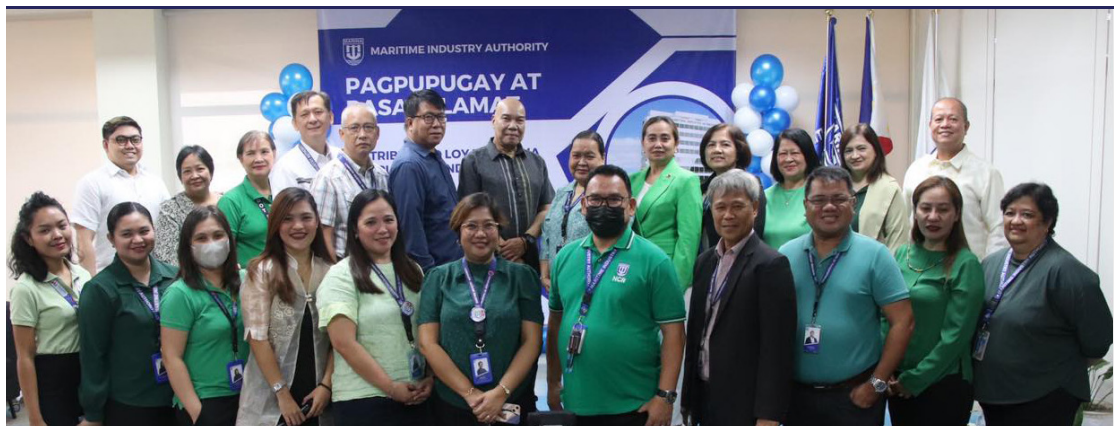
MARINA Officials and Staff are all smiles as the Agency celebrates its 49th anniversary.

MARINA Regional Office 10 Construction Reaches 20% Completion