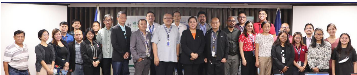
MARINA, and WWF are all smiles during the series of forum on environmental sustainability in the maritime sector.