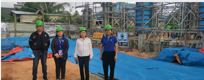
MARINA Regional Office 10 poses for a photo in front of the ongoing construction of new office building.

The construction progress of the MARINA Regional Office X (MRO10) building has reached 20% as of 20 June 2023, marking a significant milestone in the development project. The construction workers primarily consist of local residents from El Salvador City, showcasing a strong commitment to community engagement and empowerment.