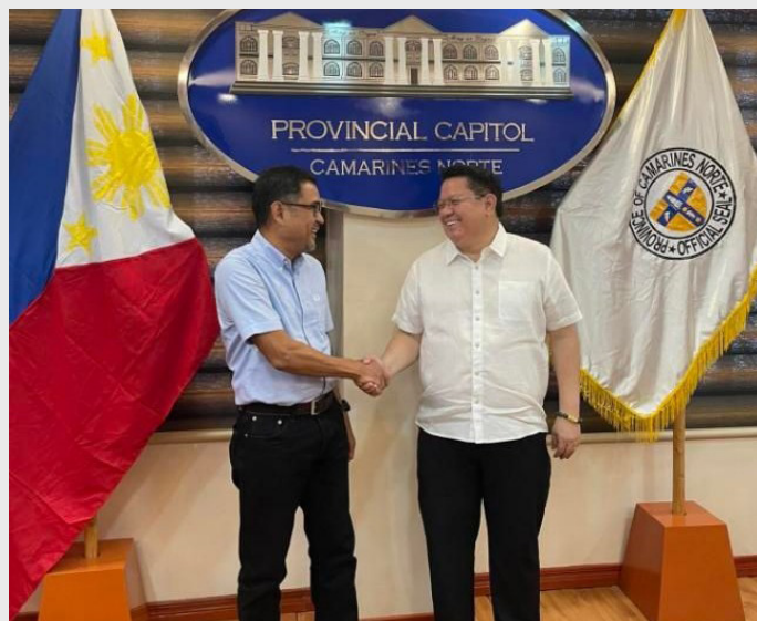
MARINA Regional Director 5, and Camarines Norte Governor shake hands to seal the deal in the proposed extension office in the province.

By establishing an extension office in Camarines Norte, MARINA seeks to bring its services closer to the local community. This move will provide convenient access to essential training programs and licensing procedures for boat operators, captains, and motormen. Moreover,