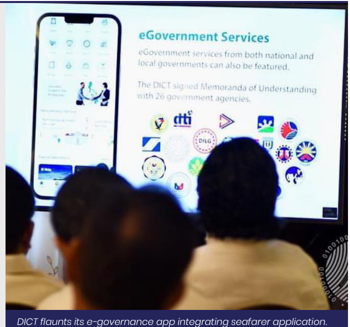
DICT flaunts its e-governance app integrating seafarer application.

This integration is part of the DICT's ongoing efforts to promote digitization and automation within government systems. It marks the initial project/service availed by MARINA