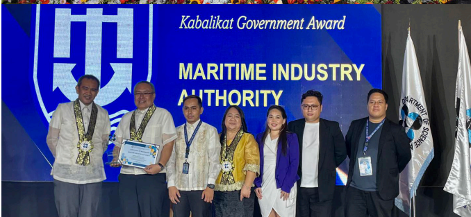
MARINA Representatives Accept the Kabalikat Award Plaque at DOST-PCIEERD's 13th Anniversary Celebration