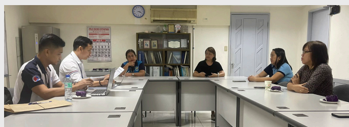
MARINA Audit Team Conducts Internal Assessment of MRO11's Processes and Services

MRO 11 has always considered the conduct of internal audit a significant exercise as it provided opportunities to assess and enhance its processes and services. The conclusion of the audit reaffirms its commitment to continuous improvement, maintaining the highest level of standards in providing its services to the maritime community in the region.