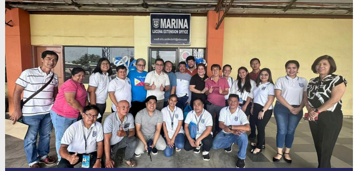
MARINA Regional Office VII Employees gather for a group photo in front of the new location of the MRO7 at the Lucena Grand Central Terminal in Lucena City, Quezon

The relocation of the office aims to enhance public service by establishing a more conveniently located facility for stakeholders.