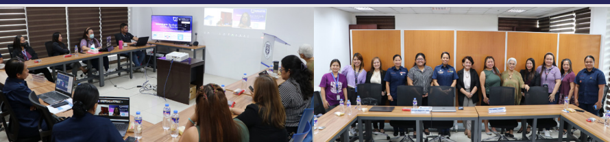
MARINA celebrates 16th Anniversary of the Women in Maritime Philippines (WIMAPHIL), with the theme Advocates for Gender Equality and Protection of Marine Environment