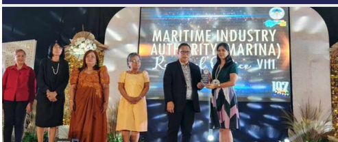
MARINA Regional Office VIII Receives Plaque of Recognition at Eastern Visayas Medical Center Anniversary Celebration