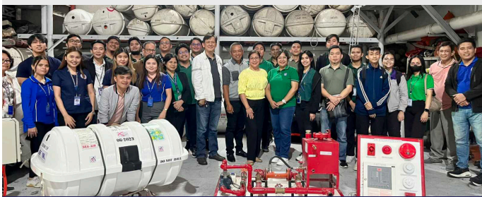
MARINA - Enforcement Service Unit with MPM Industries Company during the Training on Fixed Fire Extinguishers Systems, Liferaft, and other Life Saving Appliances in Caloocan City

The MARINA-Enforcement Service (ES) on 30 June 2023, conducted a capacity training program aimed at strengthening its personnel's skills and knowledge. Titled "Training on Fixed Fire Extinguishers Systems, Liferaft, and other Life