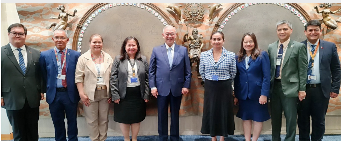
The Philippine Maritime Delegation poses for a group photo during the 80th Session of the Marine Environment Protection Committee (MEPC).

During the deliberations at the 15th session of the Intersessional Working Group on GHG from 26-30 June 2023, the Philippines emphasized the imperative of addressing seafarers' interests in the strategy. Ambassador Teodoro Locsin, speaking at the opening of the 80th MEPC session, reiterated the crucial role of seafarers in achieving the shipping industry's decarbonization objectives.