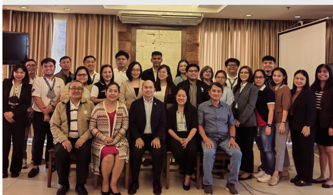
Philippine Maritime Administration concludes Inter-Agency Write Shop for IMSAS

The Inter-agency writeshop was participated by the representatives from the DOTr, MARINA, Philippine Coast Guard (PCG), Philippine Ports Authority (PPA), Cebu Port Authority (CPA), National Telecommunications Commission (NTC), National Mapping and Resource Information Authority (NAMRIA) and Philippine Atmospheric, Geophysical and Astronomical Services Administration (PAGASA).