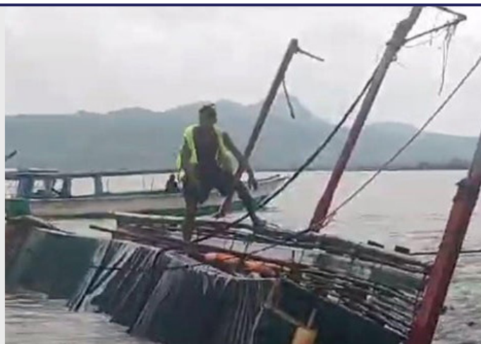
Image captures capsized MBCA Princess Aya off the Shoreline of Barangay Kalinawah, Binangonan, Rizal on 27 July 2023

Additionally, the MARINA will also initiate administrative proceedings relative to its Certificate of Public Convenience (CPC) once all relevant data is gathered and the Marine Safety Investigation (MSI) is completed.