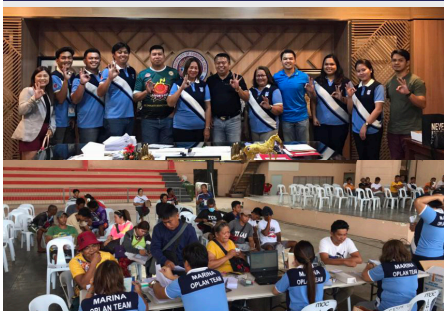
MRO7 concludes mobile registration and safety inspection initiative in Cordova, Cebu