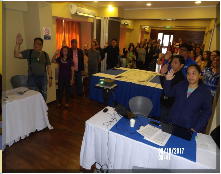
Pledge of Commitment

Formulation of the Maritime Industry Development Program 2018 – 2028