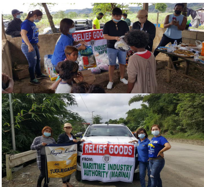
Volunteers of Pugad Lawin Tuguegarao Chapter who distributed the relief items donated by pose for a souvenir photo.

The MARINA tapped the Pugad Lawin Tuguegarao Chapter, a socio-civild organization, to distribute the food packs comprising of 500 families with food packs, rice, and other assorted goods. Recipients included the following: 150 families in Pagbangkerwan, Alcala; 125 families in Gabut, Amulung; 20 families in Quibal, Peñablanca; 25 families in Bugatay, Penablanca; 150 families in Kalapangan, Faire; and 30 families in Linao East, Tuguegarao City.