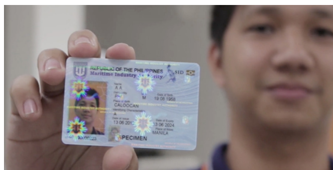
A MARINA employee shows a sample printed Seafarer's Identity Document.

According to the International Airline Services and the ATPI – a multinational travel management