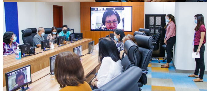
MARINA held a ceremony to honor the officials and employees who will be retiring from the agency this year at the MARINA Central Office on 15 December 2020.