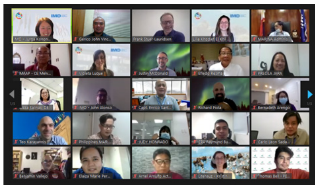
The Maritime Industry Authority (MARINA), in coordination with the International Maritime Organization (IMO), convenes the newly developed General Training Course on Biofouling Management and Invasive Aquatic Species which was held on 14 to 17 December 2020 via video conference.

On the other hand, invasive aquatic species (IAS) are species, which may pose threats to human, animal and plant life, economic and cultural activities, and the aquatic environment. The spread of IAS is now considered a major threat to the world's oceans, ecological, and economic well-being as the said species are causing vast damages to biodiversity.