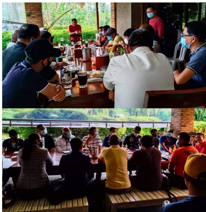
The MARINA Regional Office V, together with the representatives of the Philippine National Police (PNP), Philippine Coast Guard (PCG), Philippine Ports Authority (PPA), Local Government of Matnog, and four (4) shipping operators/ managers, convenes with Governor Francis “Chiz” G. Escudero.

The officials also said that a list of vehicles that may be exempted from the queuing line (such as ambulances, military and police, perishable goods, water tanks, or transport for IATF officials / LSIs) will be drafted by the local PNP.