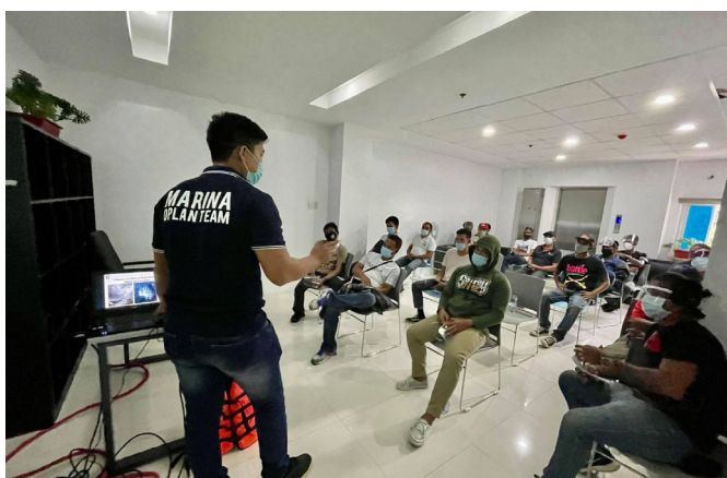
A total of 18 boat captains participated in the Modified Basic Safety Training (MBST), strictly observing health and safety protocols.

Moreover, the LGU of Pinamungahan spearheaded & assisted the licensing and certification of these local seafarers in order to relaunch the tourism-related activities of their municipality.