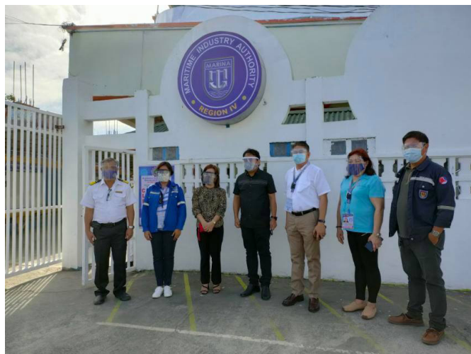
MARINA Regional Office IV officials pose in front of the Calapan City extension office.

The new satellite office will process applications that will be filed and received in the Province of Mindoro which is covered by the MRO 4's area of responsibility. Operations will officially commence on 08 March 2021.