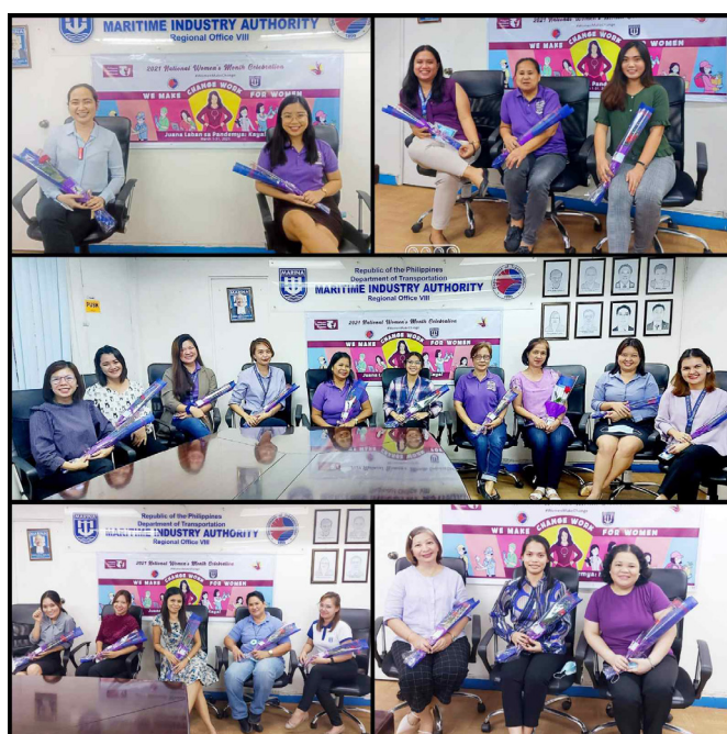
The ladies of MARINA Regional Office VIII (MRO 8) are serenaded and gifted with flowers as part of the month-long celebration.