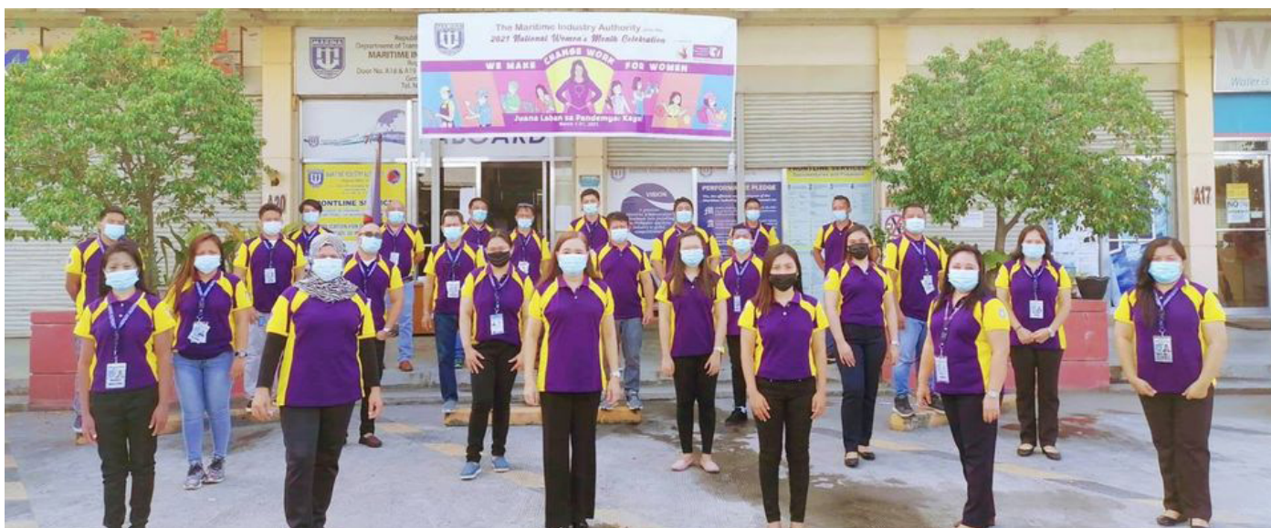
The MARINA Regional Office XII (MRO 12) staff pose with the official National Women's Month 2021 banner posted outside their office.