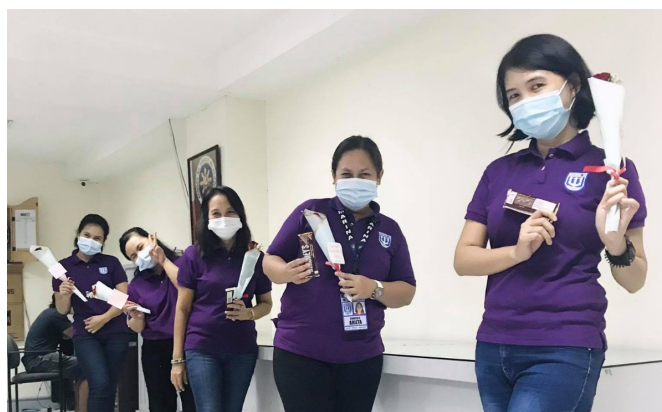
The MARINA Regional Office XI (MRO 11) gave out simple gifts to their female staff as a gesture for National Women's Month 2021.

The MARINA Regional Office XI (MRO 11) in Davao City arranged a webinar involving topics on Gender Development (GAD) and Leadership, together with a distribution of simple gifts for female personnel in the office.