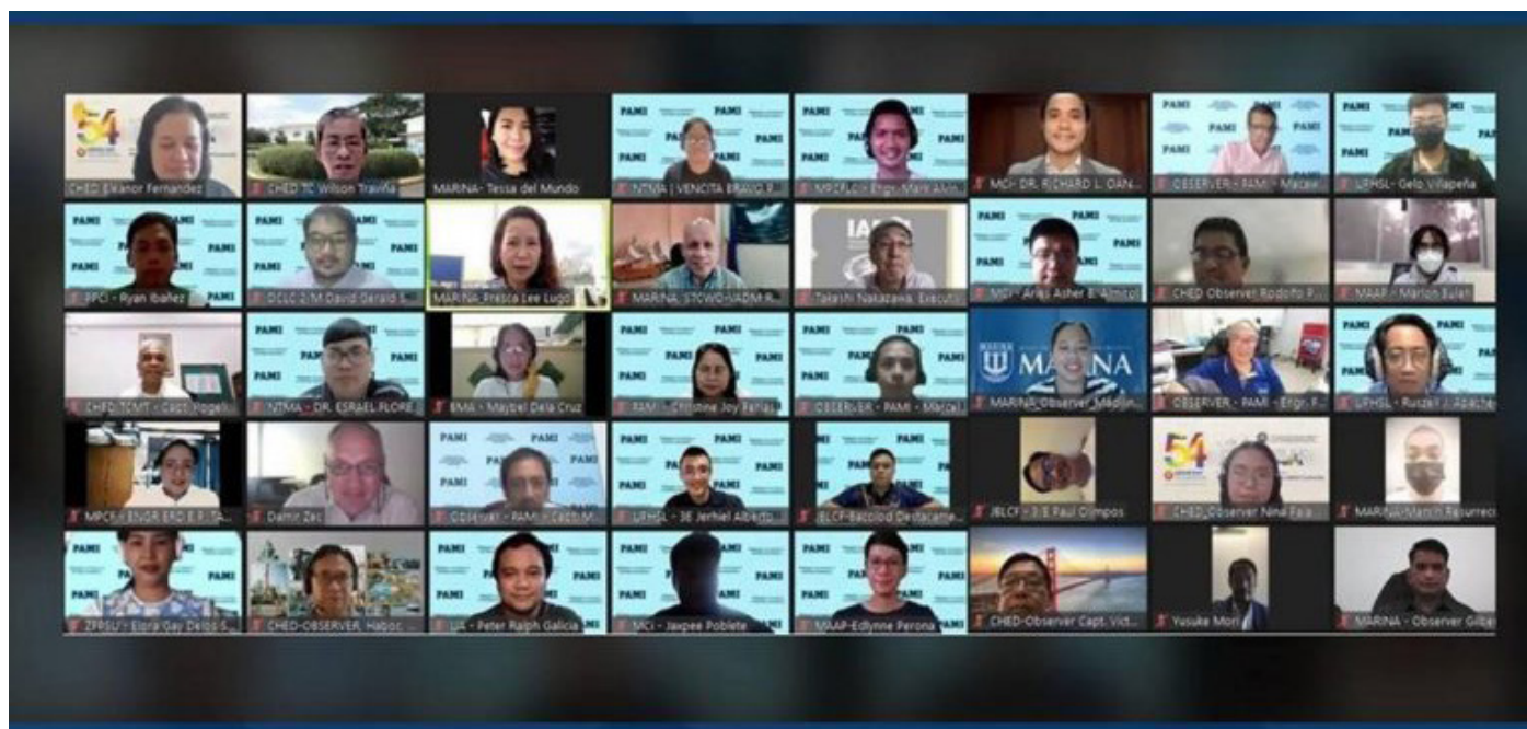
Participants from accredited Maritime Higher Education Institutions (MHEIs) across the country pose in a photo opportunity via Zoom platform during the online workshop.

The Maritime Industry Authority (MARINA), together with the International Association of Maritime Universities (IAMU), organized an online workshop entitled, "Online Learning Methods at Maritime Higher Educational Institutions," which is part of the Memorandum of Understanding (MoU) between MARINA and IAMU signed on 2018.