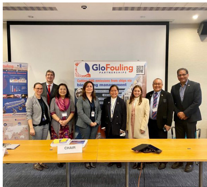
The Philippine delegation, through the Maritime Industry Authority (MARINA), during the 2nd Global Project Task Force (GPTF) Meeting of the GEF-UNDP-IMO GloFouling Partnerships Project.