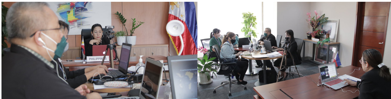
The Philippine delegation during the first meeting of the Regional Task Force on Biofouling Management Meeting for East ASEAN Seas Region.

It can be recalled that the Philippines also shared its best practices in protecting and conserving the marine environment during the 2nd Global Project Task Force (GPTF) Meeting of the GloFouling Partnerships Project which was held from 11 to 13 April 2022 at the IMO Headquarters in London, United Kingdom.