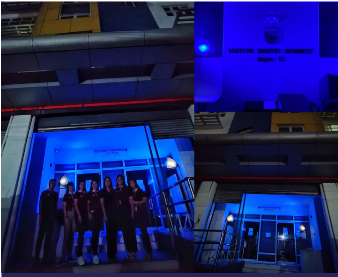
MRO 6 Joins Global Maritime Community in Illuminating its office for World Maritime Day, Embracing Solidarity for MARPOL Commitment.