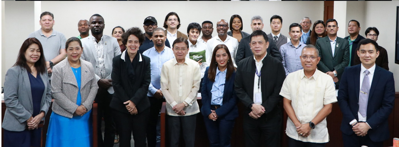
MARINA hosts World Maritime University delegation for the Field Study Program Advancing Maritime Law and Policy.