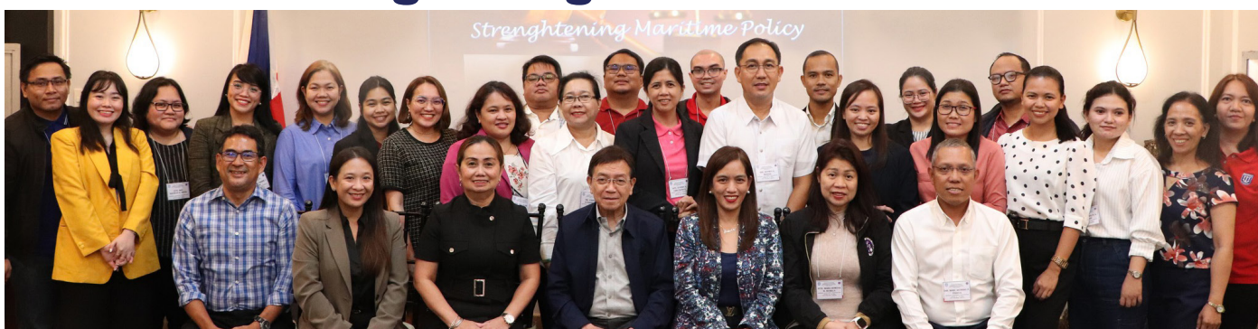
The MARINA Administrator, and Deputy Administrator band with other lawyers of the Agency during its Annual Lawyers' Convention.

In a bid to bolster its policies, the Maritime Industry Authority (MARINA) recently convened legal experts, professionals, and technical personnel for the annual Lawyers' Convention from 10 to 12 October 2023. This gathering served as a platform for knowledge exchange and professional networking, keeping MARINA's legal team informed about the latest developments in the field.