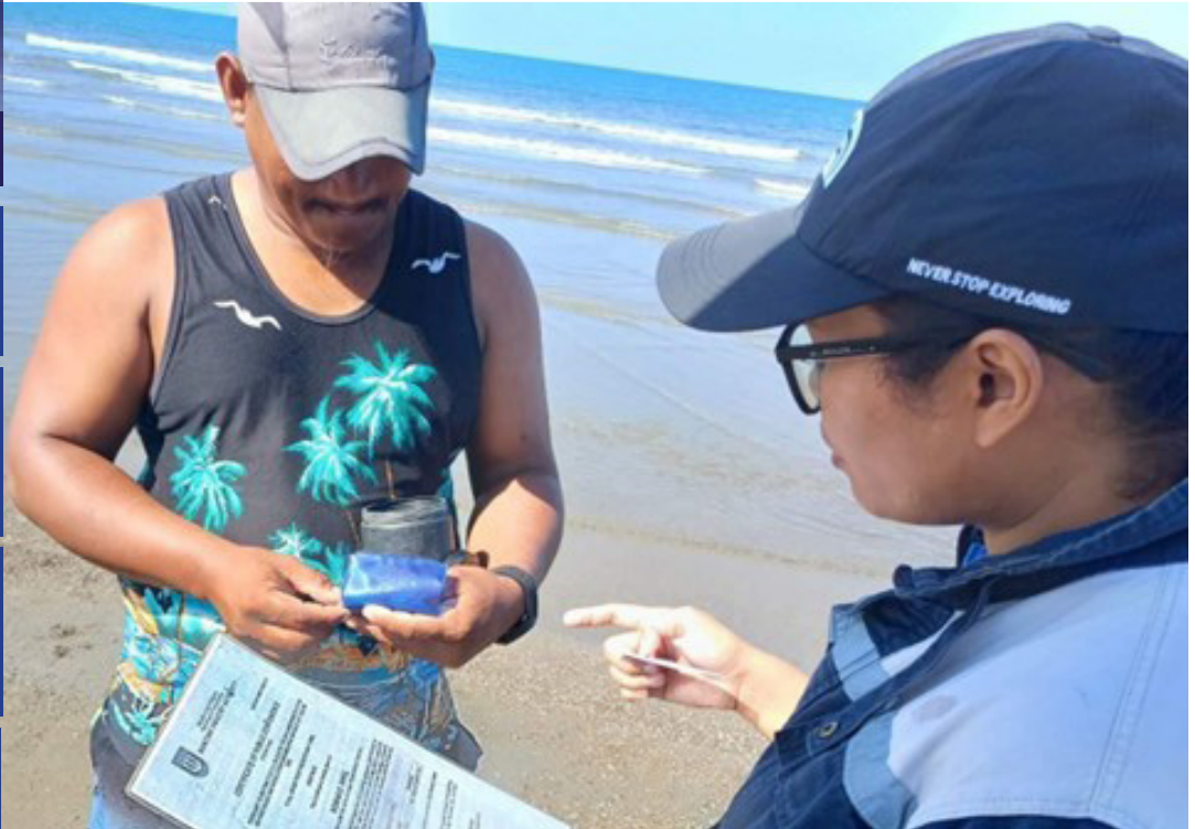
A personnel from MARINA regional office checks documents of a vessel as the agency implements heightened alert status in time for the BSKE and Undas 2023.

MARINA Strengthens Communications Team with Digital Media Workshop