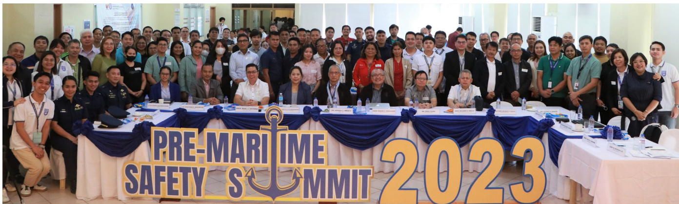
Batangas City Pre-Summit