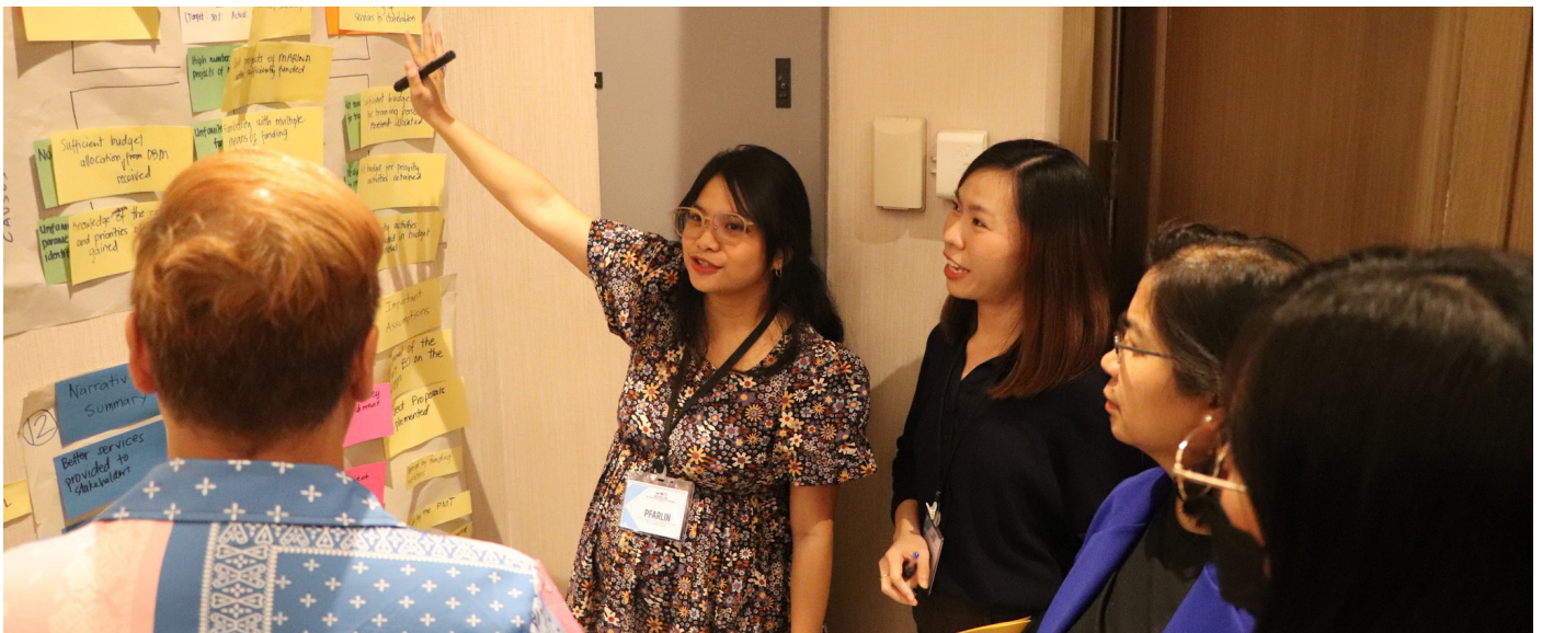
Participants of the Project Development and Management Training discuss their outputs during the three-day workshop.

The Maritime Industry Authority (MARINA) is actively advancing its industry plans and projects. To support this, MARINA recently organized a three-day Project Development and Management training from 16 to 20 October 2023.