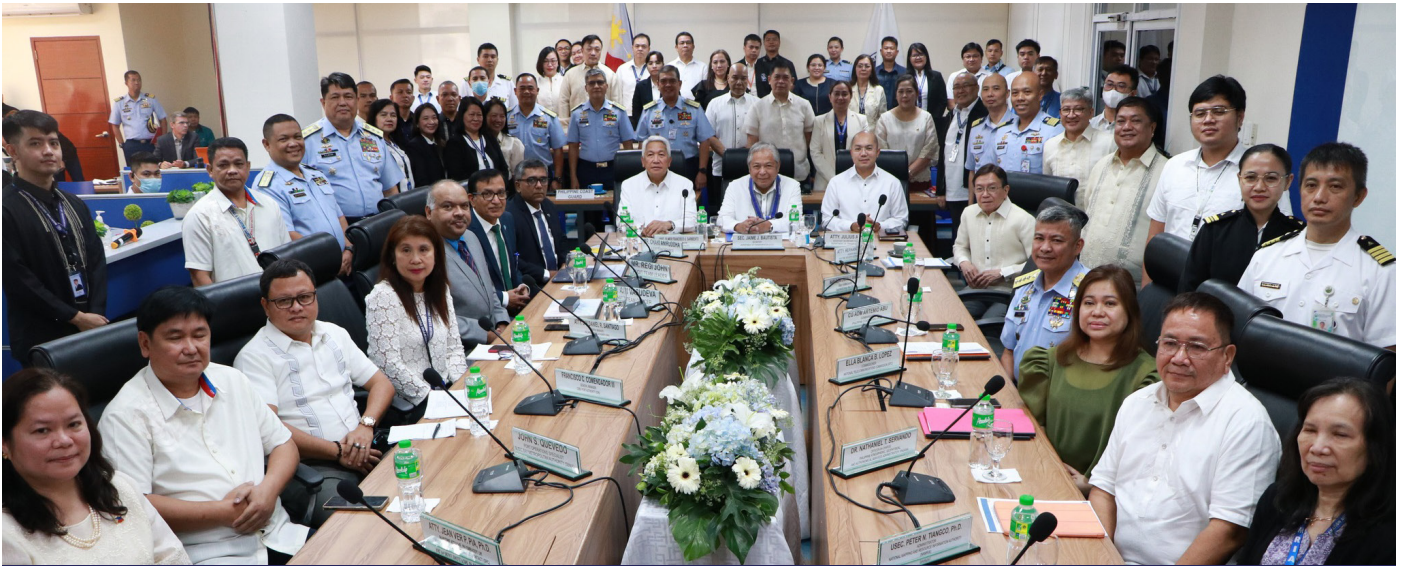
Transportation Secretary Jaime Bautista together with officials of the Philippine Maritime Industry, other government agencies and three IMO state auditors are all smiles before the IMSAS Opening Meeting held in Manila.

MANILA – In pursuit of complying with its international commitments leading to a progressive maritime administration, the Philippines is set to undergo a mandatory audit under the auspices of the International Maritime Organization - IMO Member State Audit Scheme (IMSAS) from 02 to 09 October 2023, to determine the country's full and effective implementation and enforcement of the mandatory IMO instruments to which it is a Party.