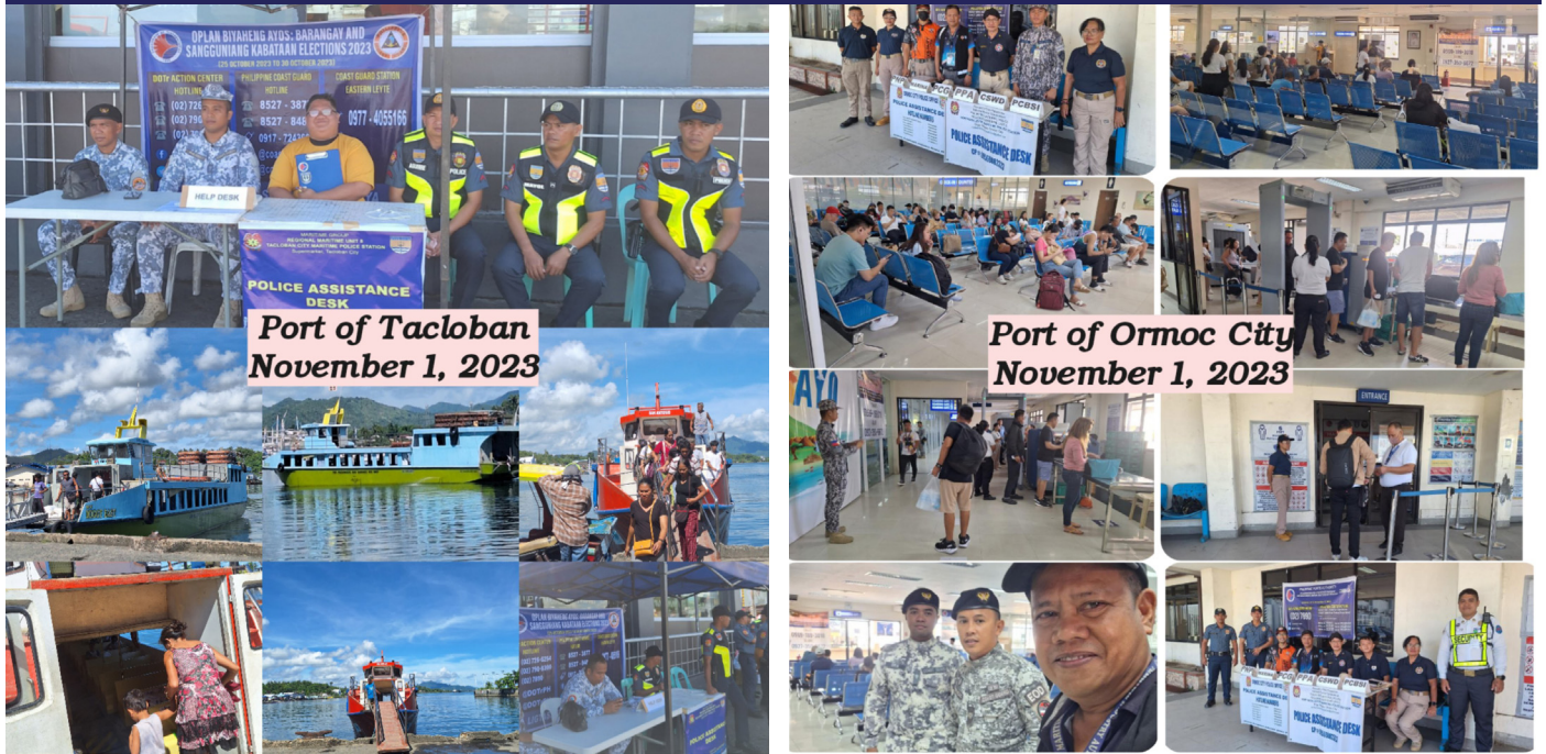
Port of Tacloban November 1, 2023