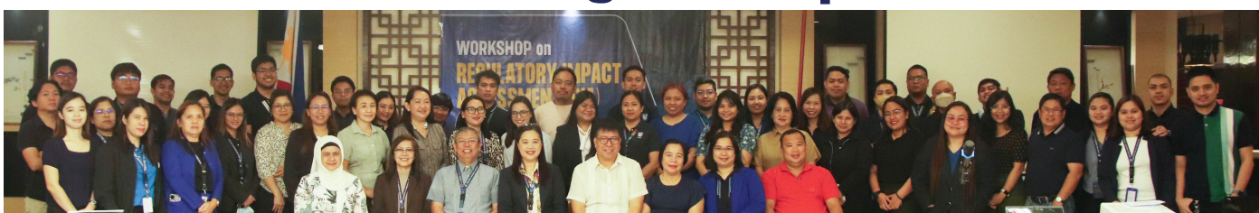
Representatives from various service units, and regional offices of MARINA during the three-day capacity building workshop on Regulatory Impact Assessment.

The Maritime Industry Authority (MARINA) continues its drive for regulatory reforms in the maritime sector through a three-day capacity building workshop. This event, held from 11 to 13 October 2023, saw over 60 personnel engaged in policy drafting from various MARINA offices, including Regional Offices.