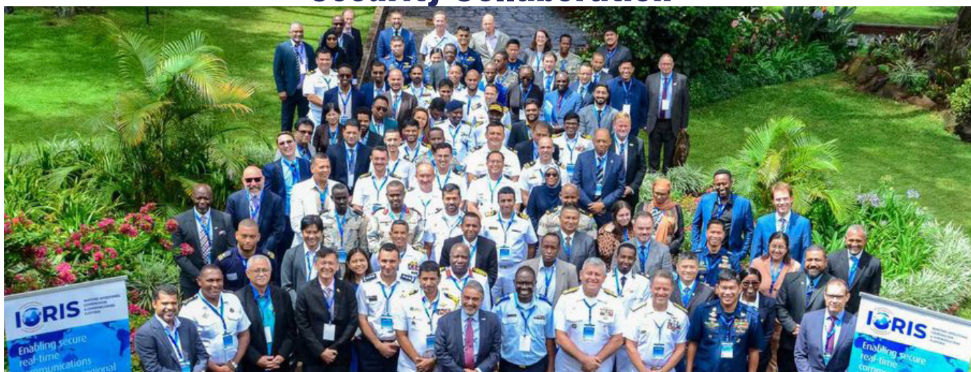
Delegates from the Indo-Pacific Region during the 1st IORIS Steering Committee Board and Working Group Meeting in Kenya.

From 16 to 18 October 2023, the 1st IORIS Steering Committee Board and Working Group Meeting took place in Nairobi, Kenya. The event brought together representatives from various government agencies and international partners, totaling 41 agencies from the Indo-Pacific region.