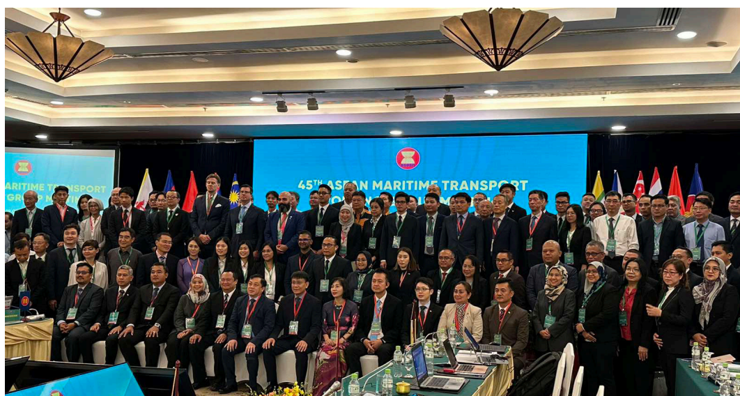
Delegates around the globe pose for a group photo during the 45th MTWG Meeting in Viet Nam.

During the 45th ASEAN Maritime Transport Working Group (MTWG) Meeting in Ho Chi Minh City, Viet Nam, the Philippines, represented by the Maritime Industry Authority (MARINA), demonstrated its commitment to eco-friendly shipping in the ASEAN Region.