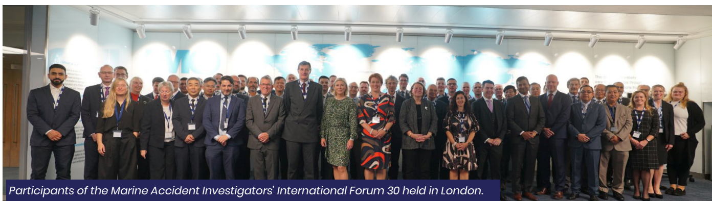
Participants of the Marine Accident Investigators' International Forum 30 held in London.

The Maritime Industry Authority (MARINA) remains committed to enhancing sea navigation safety as it participates in the Marine Accident Investigators' International Forum 30 (MAIIF30) meeting at the International Maritime Organization (IMO) from 09 to 13 October 2023.